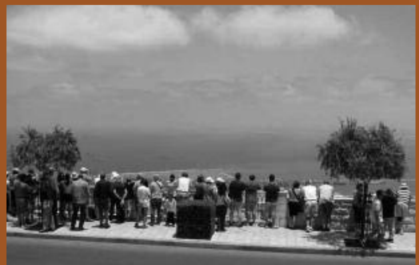
A group from Beth El traveled to Israel this summer. Top photo: Half of the group on top of Masada! Bottom photo: Overlooking Haifa