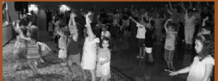
Beth El Preschool and Camp Students