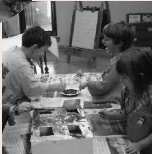
The three year olds make hanging decorations for the Sukkah out of pipe cleaners and buttons. The four year olds paint the roof tops for their Sukkahs!

BETH EL CONGREGATION בית אל הקהילה 8101 Park Heights Avenue Baltimore, Maryland 21208