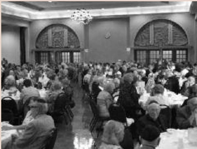
Combined Attendance of 284 people.