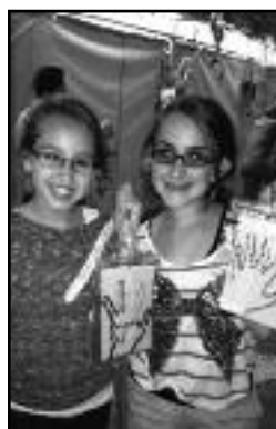
The girls were very excited to add their homemade decorations to the Sukkah.