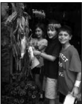
The students thoroughly enjoyed decorating the Sukkah!