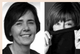
Gail Collins and Nora Ephron

GAIL COLLINS WITH NORA EPHRON: WOMEN COME OF AGE