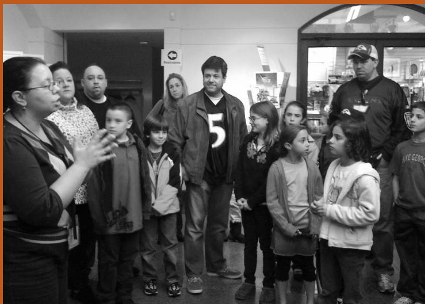
Students and parents of the Gimel Class at the Berman-Lipavsky Religious School recently enjoyed an educational, fun and historic trip to downtown Baltimore. While there the students toured the Lloyd Street Synagogue and received a guided tour of the Jewish Museum of Maryland.