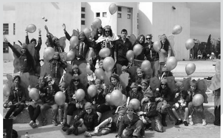
Shalom from Kehillat Netzach Israel.