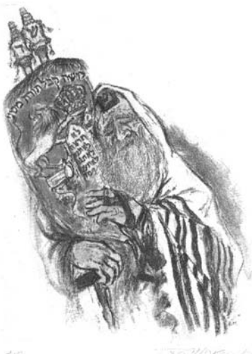
Beth El Torah Maintenance Fund