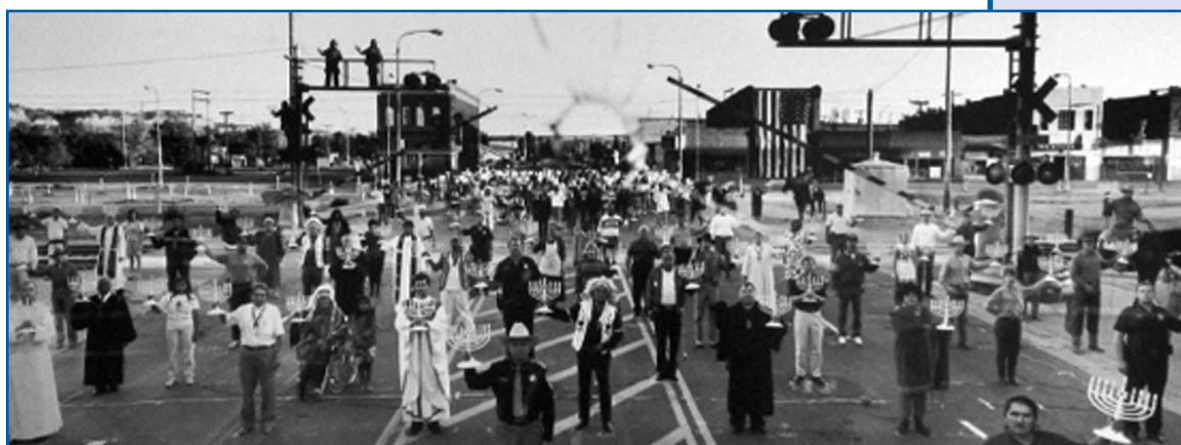
Citizens of Billings, Mt. pose for this photo showing their concern for their Jewish neighbors. The photo was published in the 1995 Billings Gazette and was reprinted with permission from Howard Greenberg Gallery.