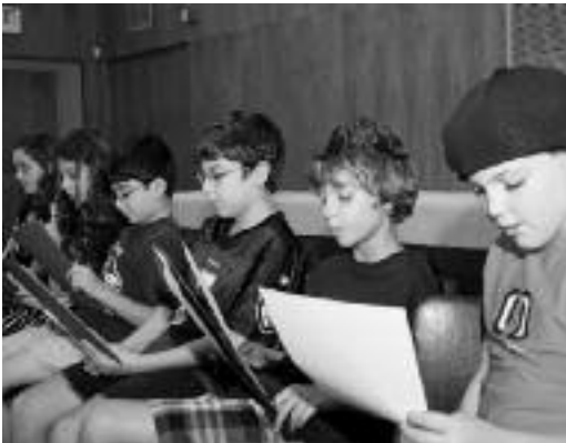
T'filah Team members learning their first prayer.